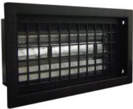
707020 Black Vent