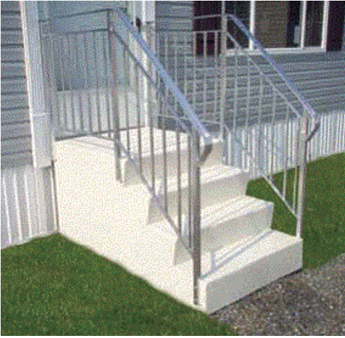
Call for a quote on a size not listed