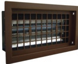
707025 Brown Vent